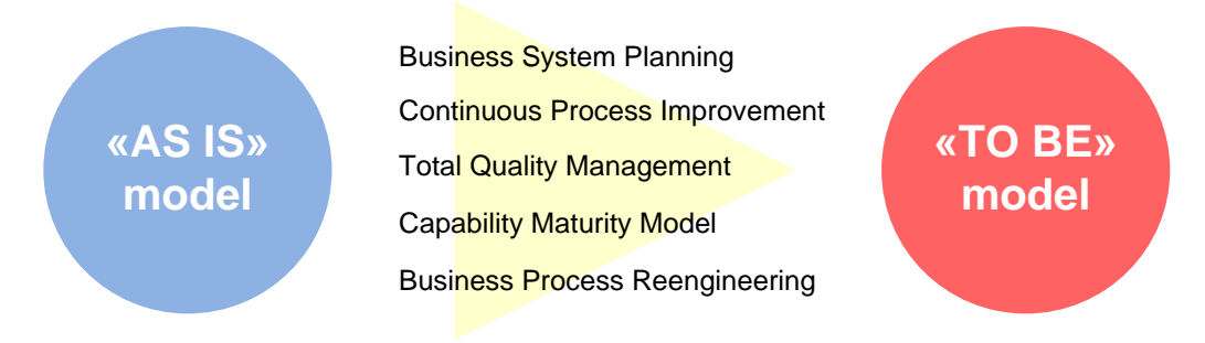
Figure 1. Ways to improve business processes

Growing business dictates his own conditions to enterprise. Sometimes there is need to break the rules and move from one business model to another. Each business model involves business processes optimized and localized to specific company needs [1]. Transition from one model to other requires business processes amendments. There are a lot of ways to improve business processes like Business System Planning, Continuous Process Improvement, Total Quality Management [2] (fig.1).